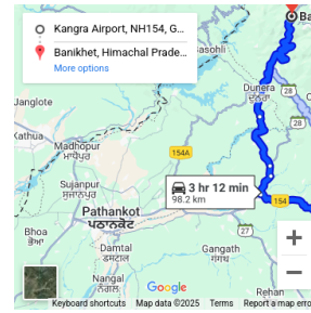
Google Map Pathankot to Banikhet